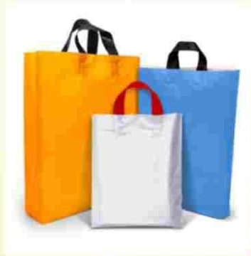
Plastic Bag or Non- woven Shopping Bags