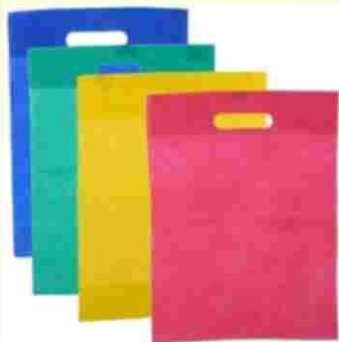
Non- woven Bags.